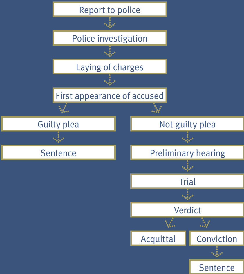
Diagram of the judicial process

This diagram is taken from Les Agressions sexuelles, Femmes et Justice, Le guide de l'usagère published by the Sherbrooke CALACS (Centre d'aide et de lutte contre les agressions à caractère sexuel), 1995, page 3.