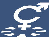
TABLE DE CONCERTATION SUR LES AGRESSIONS À CARACTÈRE SEXUEL DE MONTRÉAL